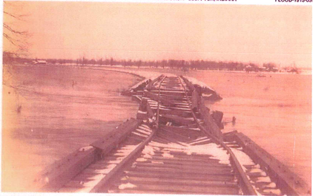
Flood of 1913 - Cincinnati, Bluffton & Chicago RR bridge washed out at 8:30am, March. The only one of Bluffton's three RR bridges to wash out during the flood. Looking north.

AZO Real Photo Post Card · Not Postally Used · Inscription on Back · Museum Collection