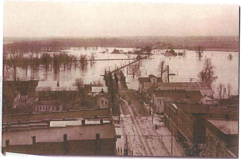
1913 Wabash River flooding, Bluffton, Indiana

The Toledo, St. Louis & Western Railroad track enters this view from the center of the left edge. It crossed the traction line a short distance beyond the river.