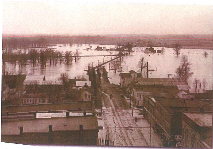
1913 Wabash River flooding, Bluffton, Indiana

1913 postcard view of flooding at Bluffton, Indiana during the Great Flood. This view is looking north on North Main Street. The iron wagon and traction bridges span the Wabash River. The buildings at the lower left-hand corner of the postcard were located on the northwest corner of Main and East Perry Streets. The 1912 Sanborn™ fire insurance map set shows a grocery on that corner and a harness business in the next building north. The third building had a REED & CO. HARDWARE sign. The Sanborn™ map set shows a hardware store at that location (120 North Main Street). A BARBER SHOP sign was posted at the southwest corner of Main and Wabash Streets. The Sanborn™ map set shows a barber located on that corner (128 North Main Street). The map set identifies the structures on the north side of Wabash Street as dwellings. The long single-story building at the left edge near the river's edge is on the north side of Water Street. The Sanborn™ map set identifies it as a feed barn (127 Water Street). A 1908 directory published by The Bluffton Banner lists the Reinhart Brothers with a feed business at this address.