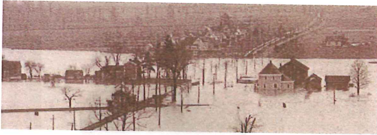
1913 Wabash River flooding, Bluffton, Indiana section 1

1913 postcard view of flooding at Bluffton, Indiana during the Great Flood. This view is looking north on North Main Street. The iron wagon and traction bridges span the Wabash River. The buildings at the lower left-hand corner of the postcard were located on the northwest corner of Main and East Perry Streets. The 1912 Sanborn™ fire insurance map set shows a grocery on that corner and a harness business in the next building north. The third building had a REED & CO. HARDWARE sign. The Sanborn™ map set shows a hardware store at that location (120 North Main Street). A BARBER SHOP sign was posted at the southwest corner of Main and Wabash Streets. The Sanborn™ map set shows a barber located on that corner (128 North Main Street). The map set identifies the structures on the north side of Wabash Street as dwellings. The long single-story building at the left edge near the river's edge is on the north side of Water Street. The Sanborn™ map set identifies it as a feed barn (127 Water Street). A 1908 directory published by The Bluffton Banner lists the Reinhart Brothers with a feed business at this address.