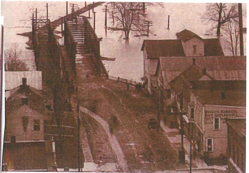
1913 Wabash River flooding, Bluffton, Indiana section 3

The Toledo, St. Louis & Western Railroad track enters this view from the center of the left edge. It crossed the traction line a short distance beyond the river.