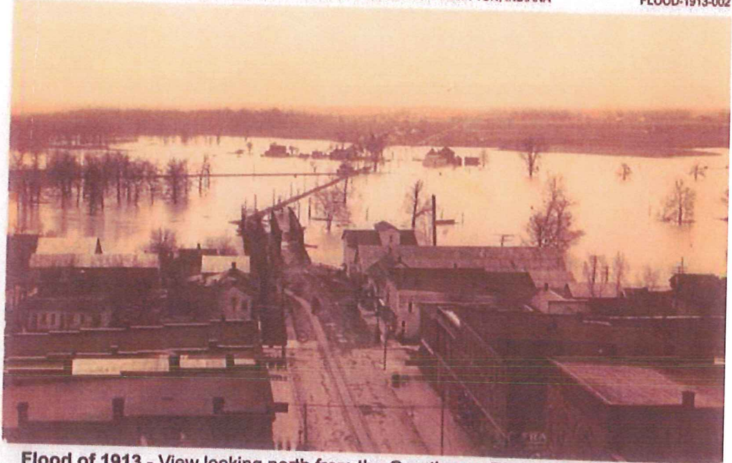
Flood of 1913 - View looking north from the Courthouse Tower. Shows water up to Main St. & Interurban bridges. Water north on Ft. Wayne Pike (N Main) to 700 block.

AZO Real Photo Post Card · Not Postally Used · No Inscription on Back